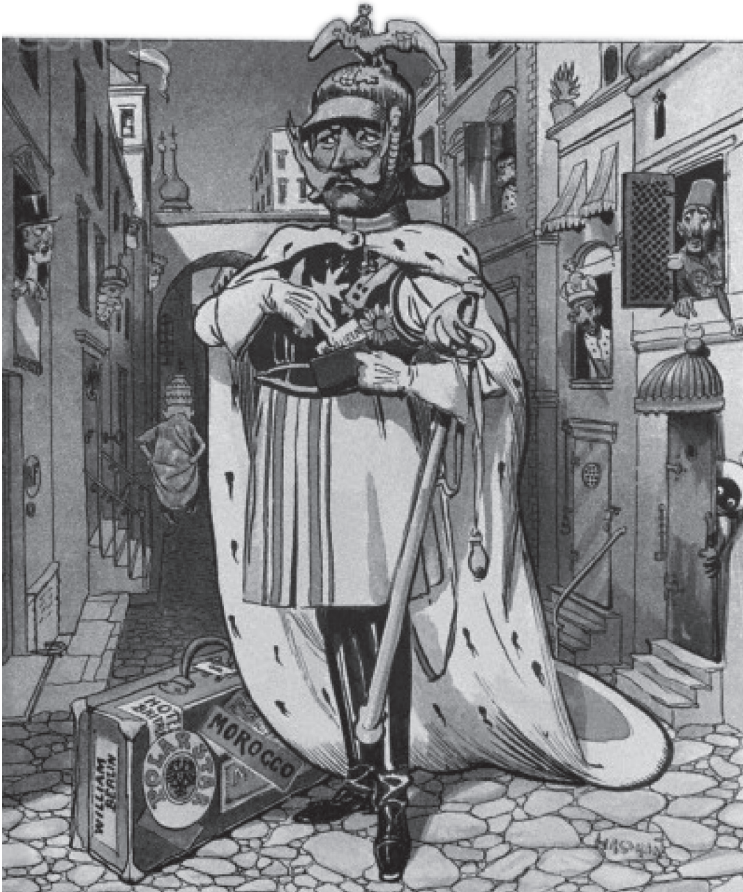
A British cartoon published in 1905. The caption to this cartoon read 'The Morocco Crisis: Let men see - whom shall I call on next?'