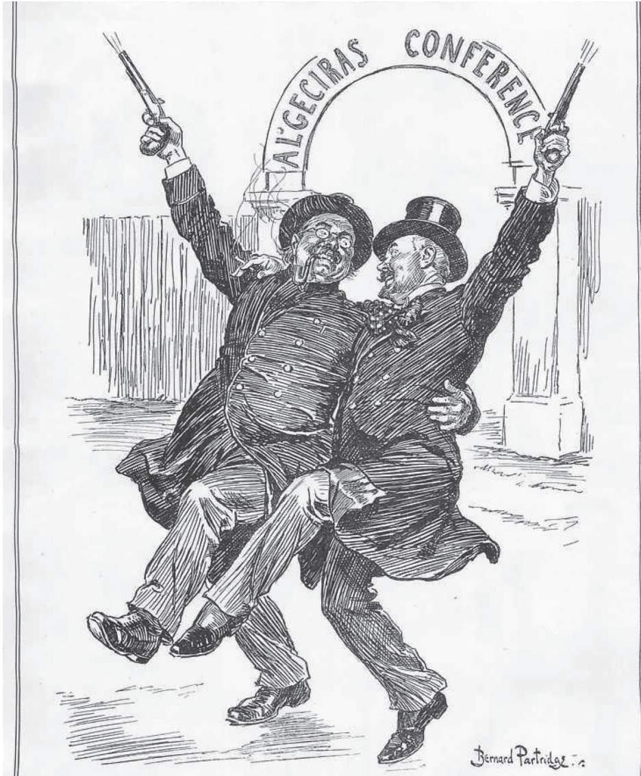
A British cartoon entitled 'Shots of Joy', published in April 1906. The caption to the cartoon read 'The Algeciras Conference has practically been concluded to the mutual satisfaction of the two rival powers whose differences at one time threatened to end in something worse than a diplomatic duel.'