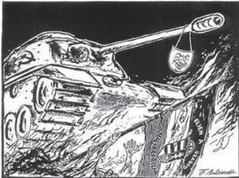
A Dutch cartoon published in November 1956. The caption read 'Peace and order are restored'.